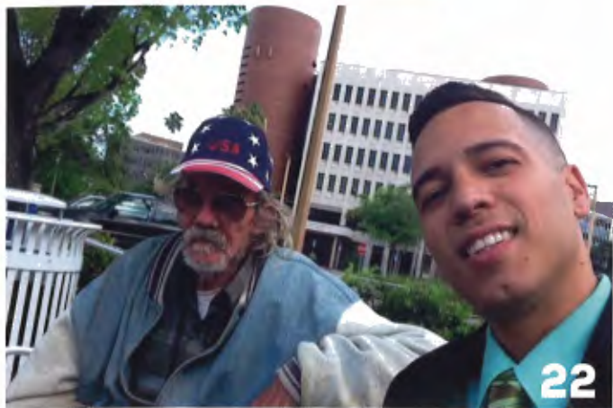
On the cover: The LCBA is kicking off the #KindLee Campaign in February to inspire members and our community by sharing acts of kindness on social media using the hashtag "#KindLee"